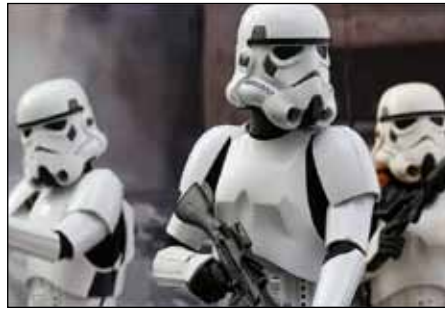
Imperial Stormtroopers patrol the 2nd annual Santa Ana Elks Car & Motorcycle Show

Later in the month, on June 23, we will be hosting our second annual Charity Car and Motorcycle Show. We are excited about this year's show as we ready ourselves for the big day. This year, we are expecting nearly 200 cars and motorcycles, over a dozen vendors,