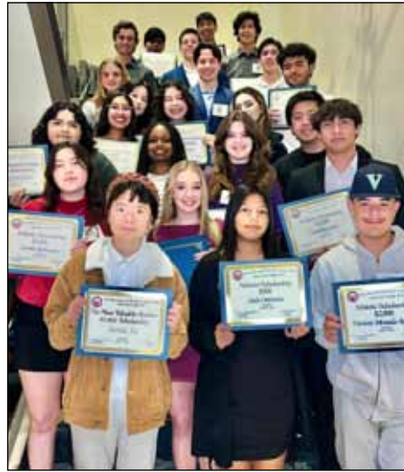
Earlier this year, the Santa Ana Elks Lodge awarded $51,500 in scholarships.

Some dates for you all to mark your calendars, our annual Scholarship Information Night will be held